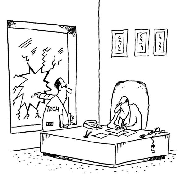
"Is that computer, down there, the one you were having problems with?"

It's important to stay up-to-date on all the new methods used by cybercriminals in order to keep your business protected.