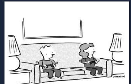
"It's interesting - Mom hates early Christmas sales, but she loves early back-to-school sales."